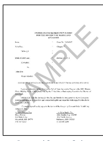
Proposed Consent Order