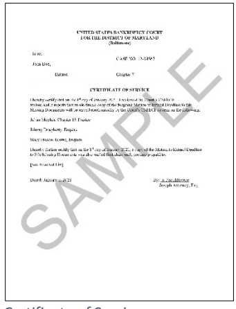
Certificate of Service