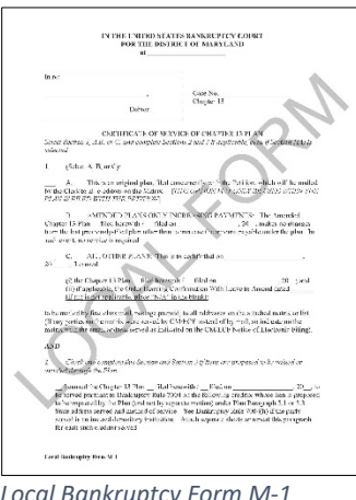
Local Bankruptcy Form M-1