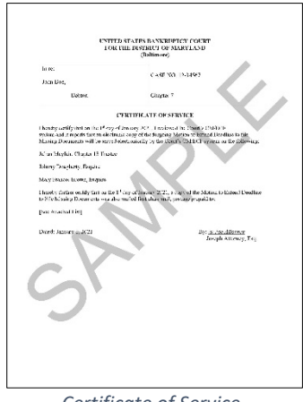
Certificate of Service